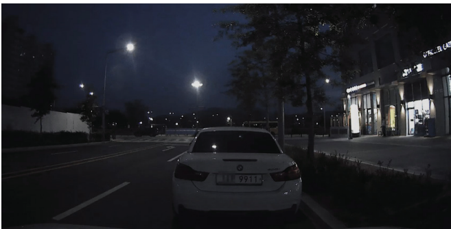
▲ NIGHT VISION OFF

IROAD NIGHT VISION employs ISP (Image Signal Processing) technology and real-time image processing function to brighter images when recorded under night time parking mode.