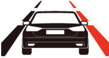
LDWS Lane Departure Warning System

The X5 is equipped with Road Safety Warning Systems that provide audio and visual alerts for Lane Departure (LDWS), Front Collision (FCWS) and Front Vehicle Departure (FVDW). It detects road markings and gives voice warnings to the driver if the vehicle begins to stray from its lane or when it is at risk of an imminent crash.