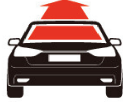
FVDW Front Vehicle Departure Warning