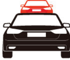
FCWS Forward Collision Warning System